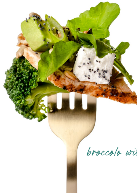
broccolo with chicken