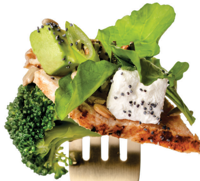
broccolo with chicken